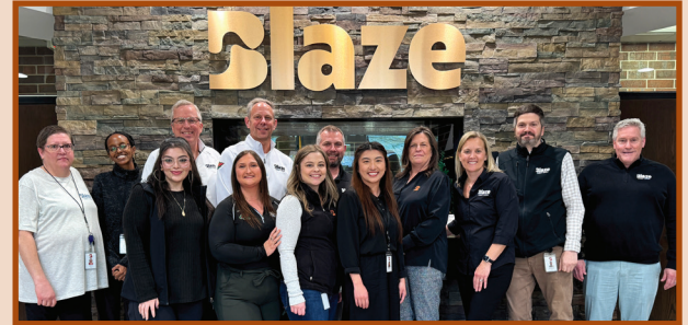
Blaze Digital Banking Team

Q2 Holdings, Inc., a leading provider of digital transformation solutions for financial services and Blaze's digital banking provider, announced Blaze as one of the 2026 Q2 Excellence Award recipients. The annual award program recognizes banks and credit unions driving significant business outcomes and strengthening the communities they serve, ranking them among the industry's best financial institutions.